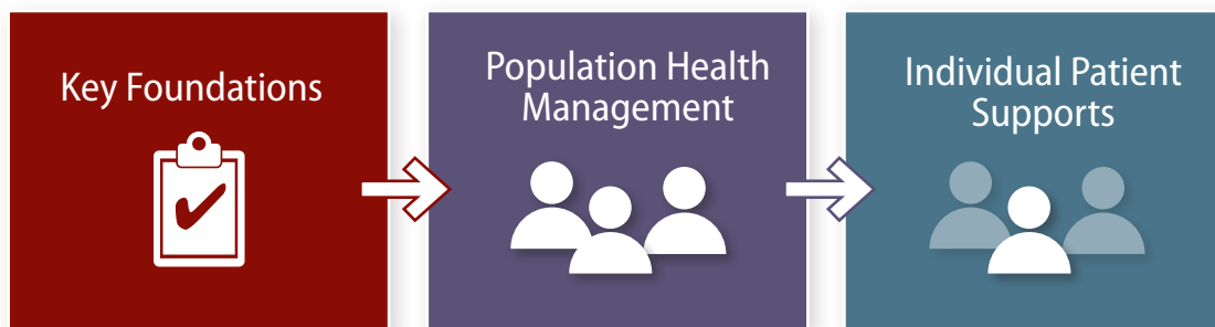
Figure 1. Hypertension Control Change Package Focus Areas

While the science behind cardiovascular risk reduction is continually evolving, there is strong evidence that a systematic approach to HTN management can significantly improve HTN-related care processes and outcomes. The purpose of the HCCP is to help healthcare practices put systems in place to care for patients with HTN more efficiently and effectively. The HCCP is broken down into three main focus areas (Figure 1):